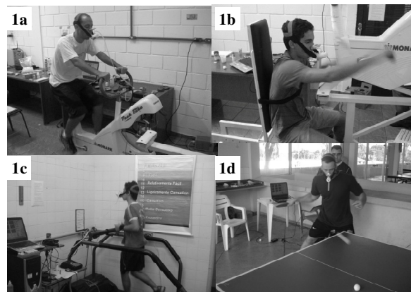
Fig 1. The figure shows the exercises performed in cycle ergometry (1a), arm crank ergometry (1b), treadmill (1c), which were considered as conventional ergometers, and the exercise in table tennis-specific procedure (1d).

(YSI, Yellow Springs, OH, USA). Blood samples were also taken at 3, 5 and 7 minutes after the test. During all GTXs the oxygen uptake ( \text{VO}_2 ) was measured every three breath cycles by a portable metabolic system (MedGraphics VO2000, Medical Graphics Corp., St. Paul, MN, USA). The gas analyzer was always calibrated before each test following manufacturers' recommendations. Heart rate (HR) values were continuously recorded with gas exchange (Polar, Kempele, Finland) and interconnected with portable metabolic system. In all GTXs, gas exchanges and HR samples were averaged every 30 seconds, and the highest values reached were regarded as peak values. Rating of perceived exertion (RPE) (Borg, 1982) was also measured after exercise stages. The anaerobic threshold was considered as the intensity of fixed lactate concentration corresponding to 3.5 \text{ mmol}\cdot\text{L}^{-1} (OBLA) (Morel and Zagatto 2008; Zagatto et al. 2008). Figure 2 shows an anaerobic threshold determination.